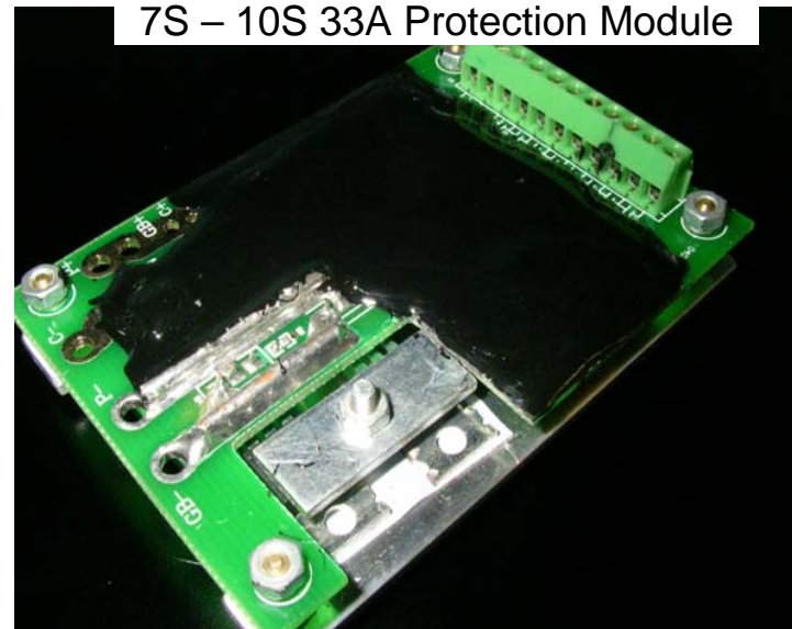
7S – 10S 33A Protection Module