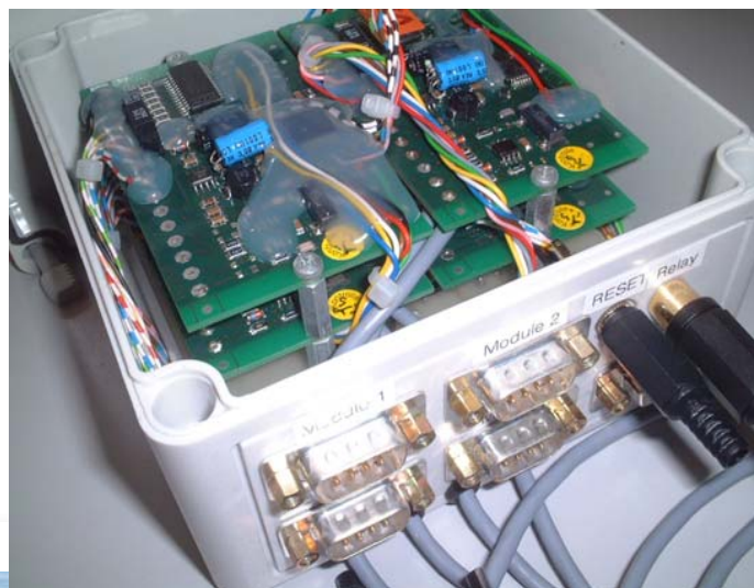
100S Electric Vehicle Module