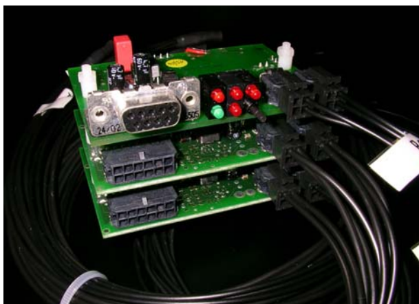
RS232 Protection module up to 28S